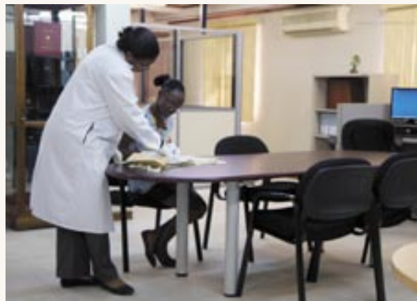
Archives Reading Room

The Centre will seek to expand on its outreach programme in order to attract a new crop of researchers. The records housed therein cover a range of research themes including regional integration, federalism, decolonisation, constitutional reform, social welfare,