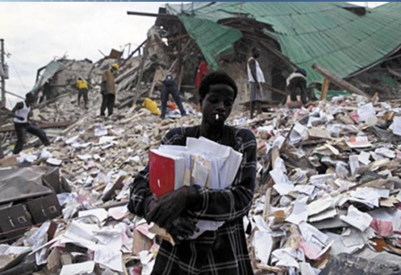
Haiti after the earthquake.