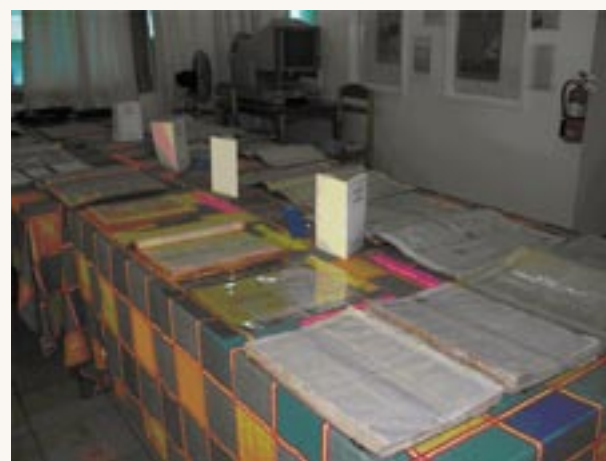
Newspapers and Booklets