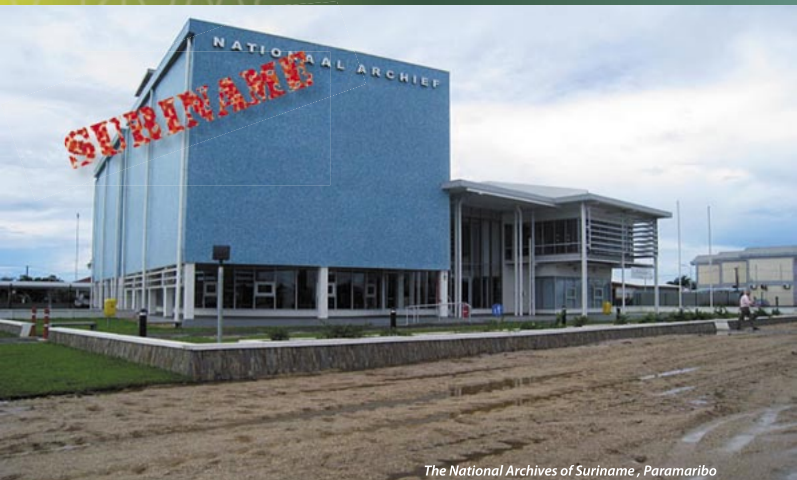
The National Archives of Suriname , Paramaribo