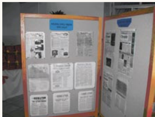
Headlines from the past

The exhibition was advertised in the print and electronic media, and flyers were placed at numerous business places and institutions. Some people were also specifically invited. However, based on the feedback, we will need to directly target the secondary schools if we expect a good turn out of students.